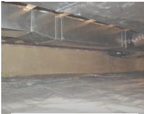
Foam Crawlspace Walls