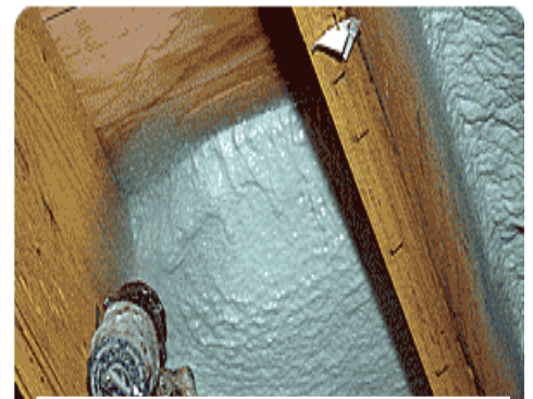
Foam Basement Ceiling