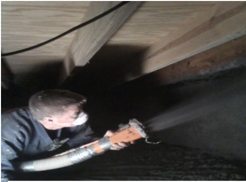
Crawlspace Walls Cellulose