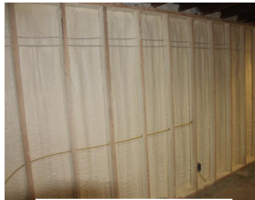
Foam Basement Walls