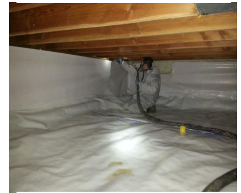
Rim Joists/Vapor Barriers

Crawlspaces are prone to high levels of humidity and moisture that can lead to mold and mildew. Inadequate insulation allows toxins from mold and dangerous outside air pollutants to enter living areas of the home.